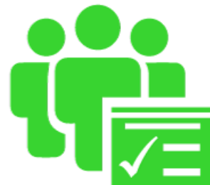
Sales & Service Network