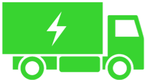
Advanced Vehicle Technologies